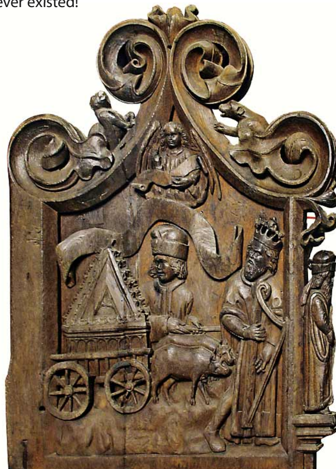
David's Dance before the Ark ca.1450, detail of the choir stall, Maulbronn, abbey

In the film Raiders of the Lost Ark by Steven Spielberg, Harrison Ford plays an archaeologist, Indiana Jones, who searches for the Ark.